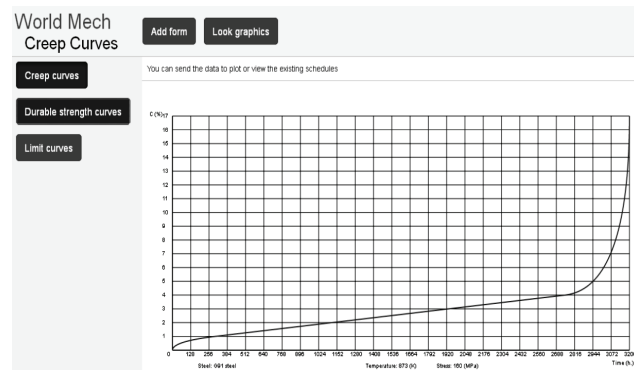
Figure 3 – Presentation of creep curve