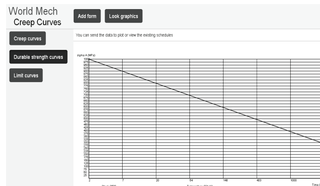
Figure 4 – Presentation of long term strength law

The third form uses for input of experimental results which represent the data set characterizing the fracture of specimen. Coordinates here are mean and amplitude stresses which combination brings to fracture at the same time. The user has to be filled these data in an array with two columns.